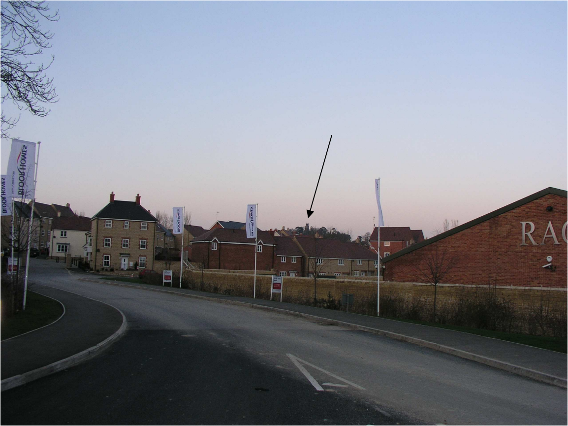
P16: Volunteer Way. Folly can be seen through a few gaps: