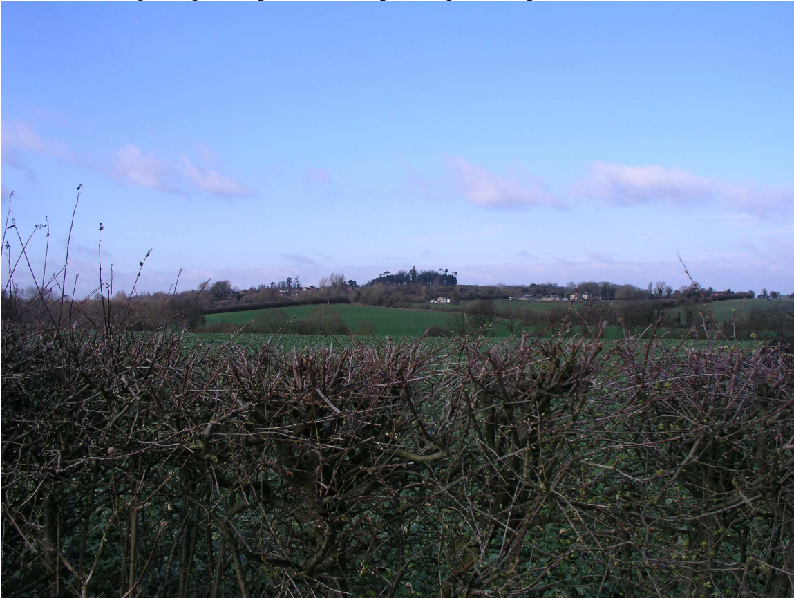
P42: Path from Little Coxwell to Wicklesham; approx 300m before Wicklesham. Distance to Stanford Rd slope is approx 1500m: