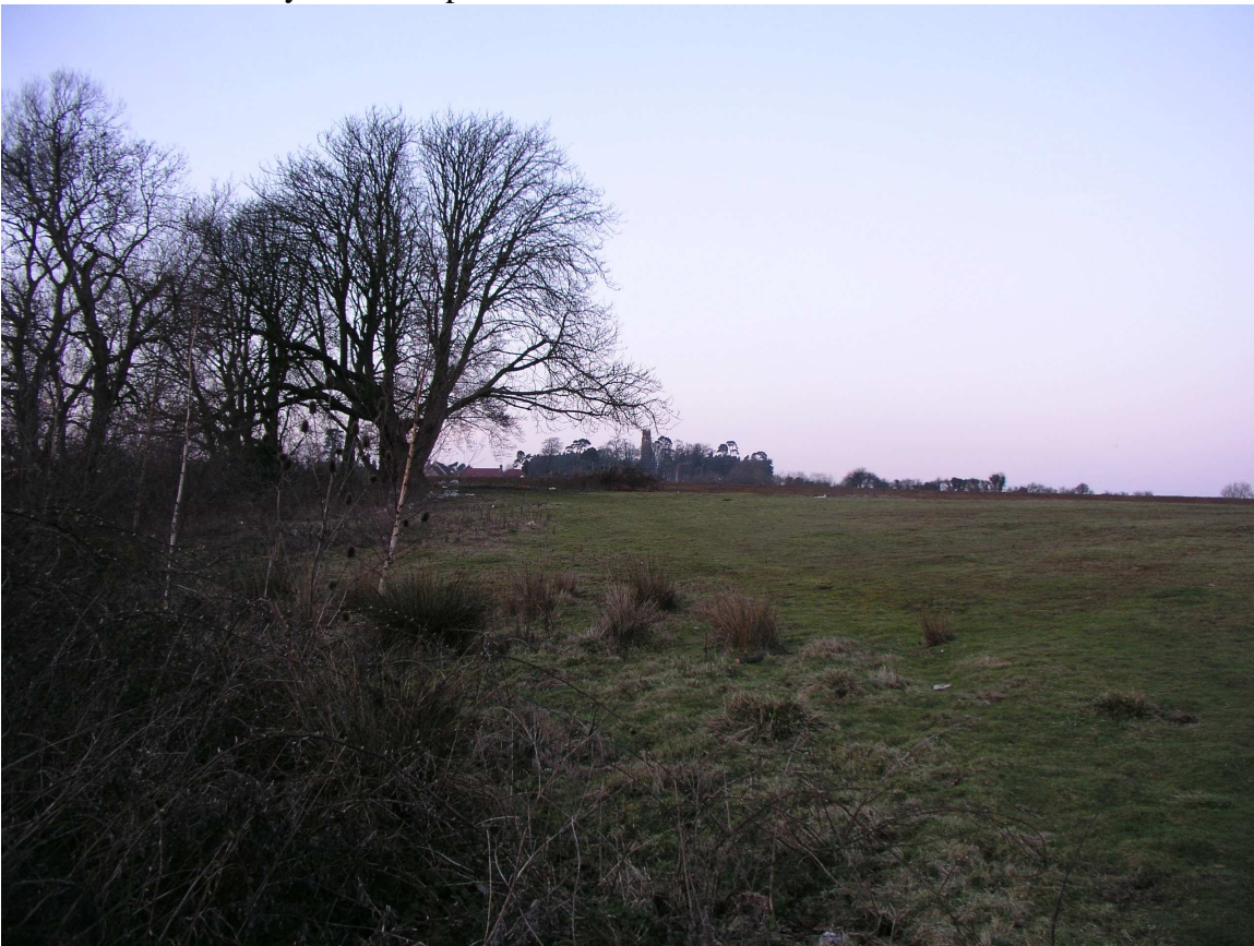
P20: Walking towards Stanford Rd. New Clubhouse roof coming in to view. Courts would not yet be visible: