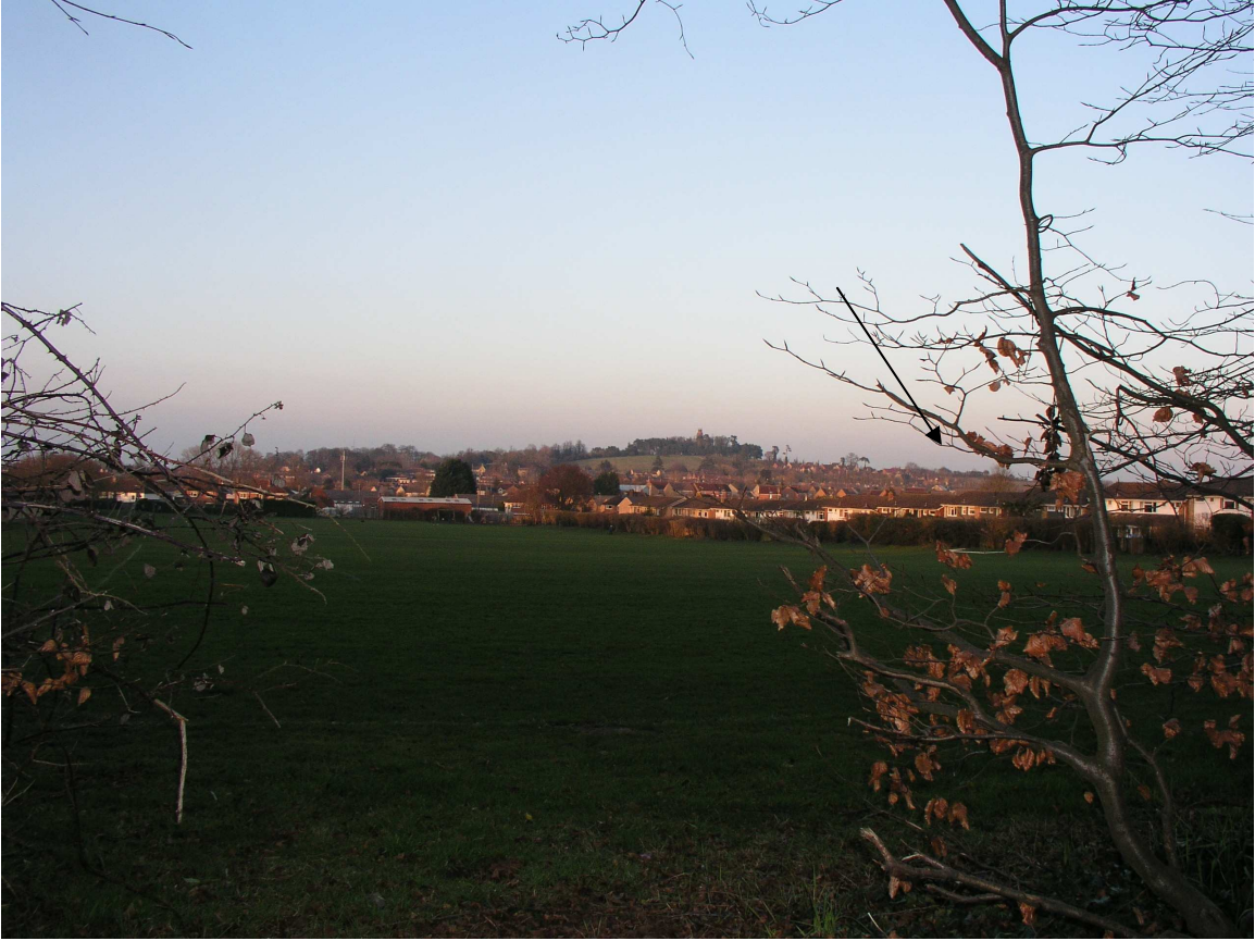
P4: Top of Marines Drive